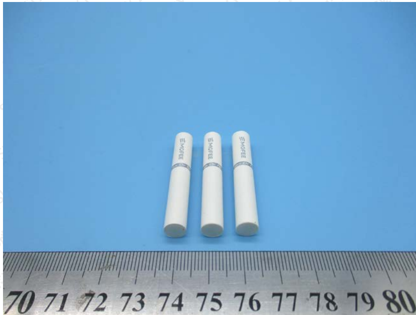
CPC240031-2: HNB tobacco - Bronze